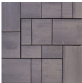
Light And Stormy